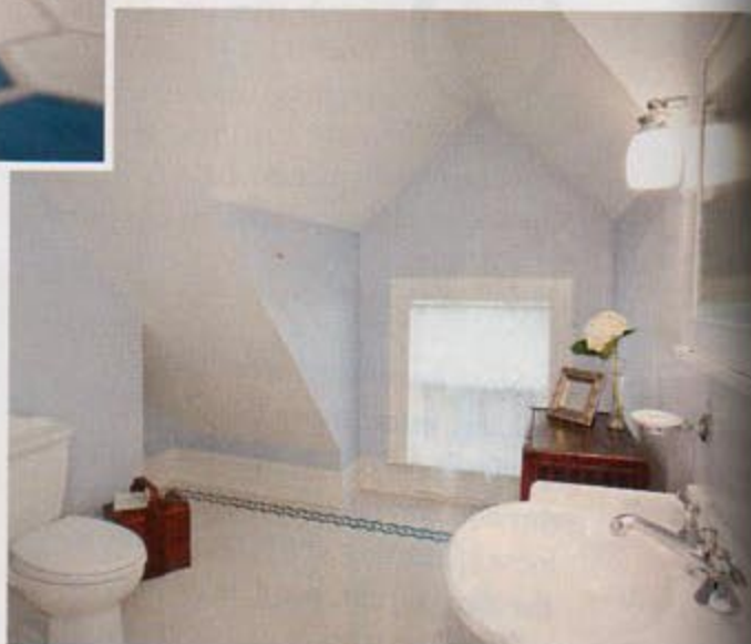
CLOCKWISE FROM LEFT: The gable defines the bathroom, adding instant charm. A detail of the hex tile border turning a corner. The vintage-inspired new HVAC grate. The view from the door.