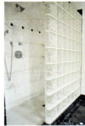
The upstairs bathroom was expanded to make room for a walk-in shower and a tub.

Another wrinkle in the remodel was the couple's art deco antiques and furnishings that contrasted with the Arts and Crafts home. Orfield's challenge became to blend the two styles without creating another mismatched remodel.